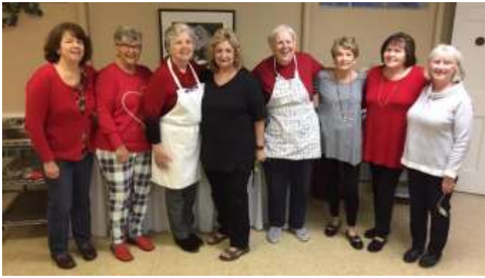
The Rachael Circle who prepared the Sweet Heart Potato Bar last Wednesday.