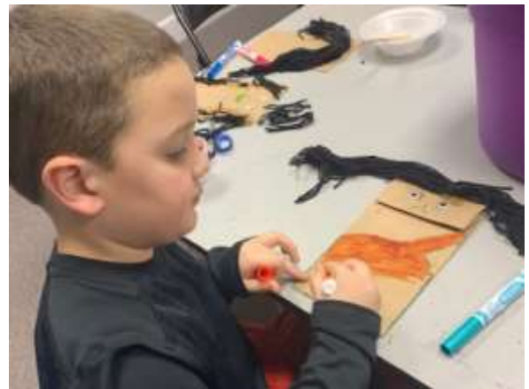
Kingdom Kids making Samson and his hair! Join us every Wednesday after school for fun, Bible lessons, food and fun!