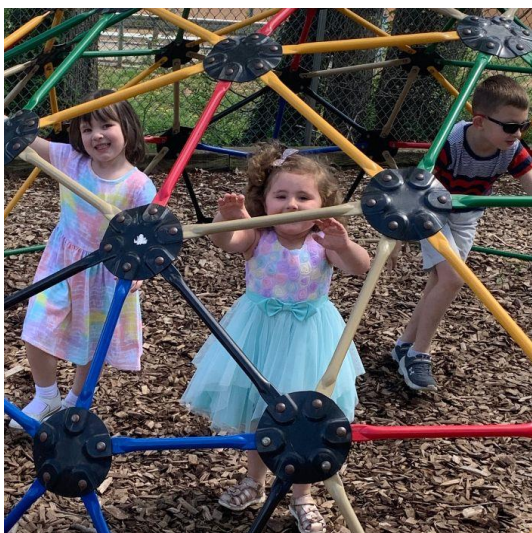
More photos of our Children from last Sunday.

Resurrection day was a wonderful day at May Memorial, and I rejoice that we were together, and hymns filled our hearts and our sanctuary. Alleluia!